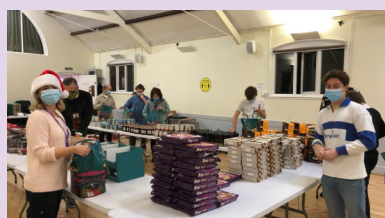
Christmas Parcel Team

Christmas Parcels Senior Outings Family Outings Home Visits Befriending Office Administration Utility Grants School Trips Grants Coffee Mornings Well-being Transport Seniors Fair Hall Bookings